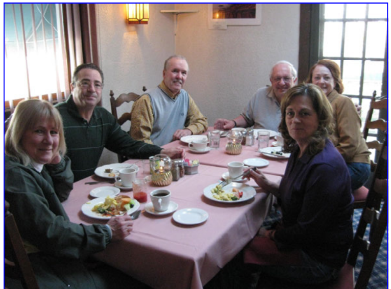
Here are some familiar faces of members who attended the SLA breakfast at Mangino's Restaurant on Saturday, April 9. The Events Committee did a great job of organizing the event and Mangino's offered a wonderful variety of breakfast foods.