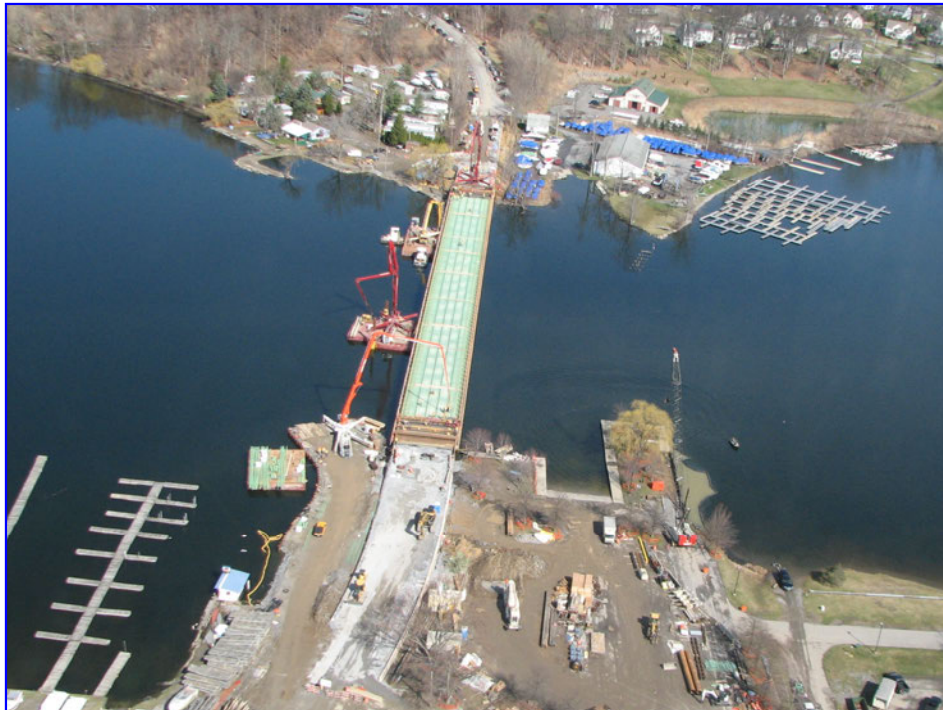
A stunning aerial photo taken during the placement of concrete for bridge deck pour #1.

The contractor continues to struggle with the spring weather and to their success they have been able to complete the two bridge deck pours over the past couple of weeks. This is yet another major milestone that has been completed by the workers as they stride towards the opening of the new bridge. While the deck pours are undergoing the required wet cure, the contractor is continuing on the drainage and roadwork. As the daylight hours increase this time of year, so will the contractor's work hours. Workers will be onsite daily from 6:30 AM to 5:30 PM Monday through Friday, with Saturday work expected as well.