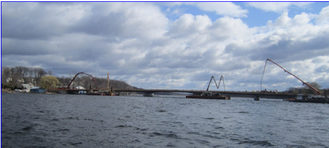
Concrete pump trucks deliver concrete to the new bridge during deck pour #2.