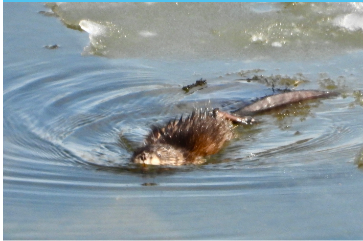
Top Photo: Injured Owl George from Powerboat Services Below: Muskrat swimming Jon Weillbaker