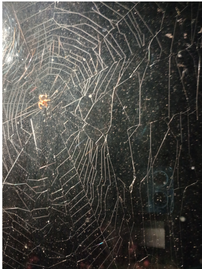
Spider Trying to Keep Warm

For information regarding boat certificate requirements and boating safety courses, call OPRHP (Office of Parks, Recreation and Historical Preservation) at 518-464-0456 or visit the OPRHP boating education page.