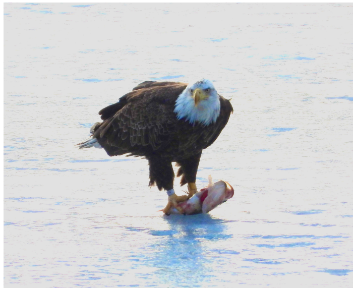
Top: Jon Weilbaker's eagle with bands eating fish near Waterfront Park.