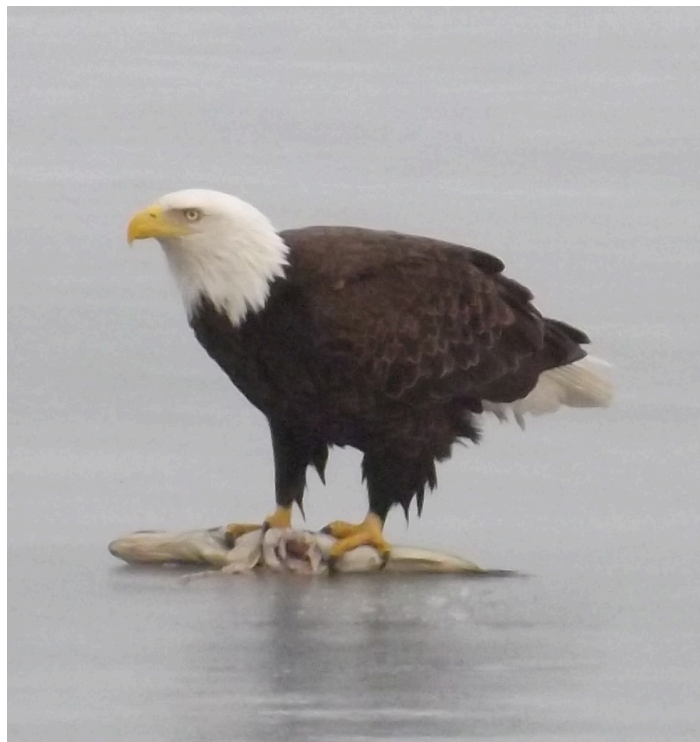
BOTH TAKEN ON MARCH 15TH.