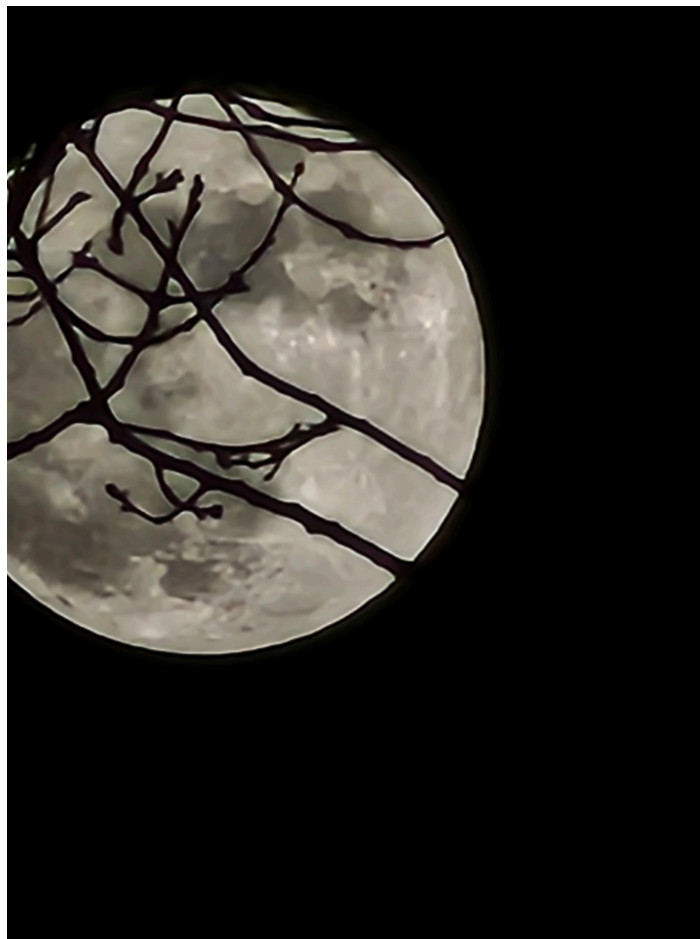
Lunar Eclipse Eric Goodness