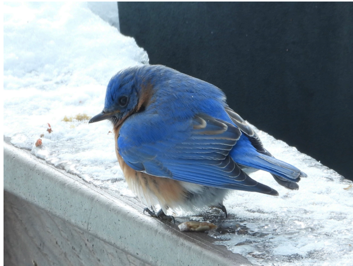
Bluebird Resting Near Waterfront Park