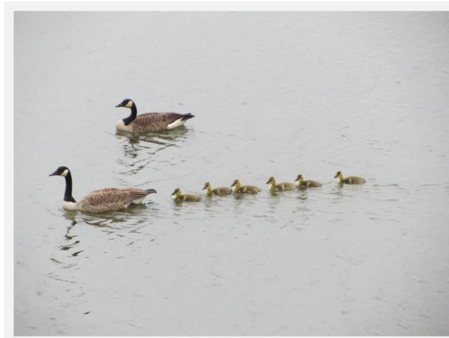
Mom and Dad take the kids out for a swim.