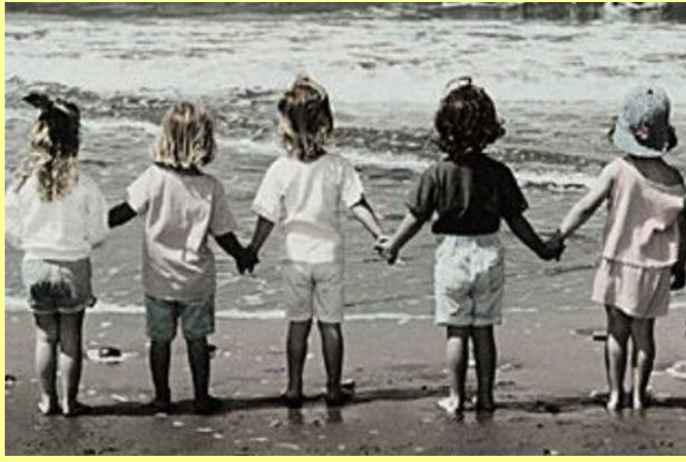
Waiting for Brown's Beach to Open